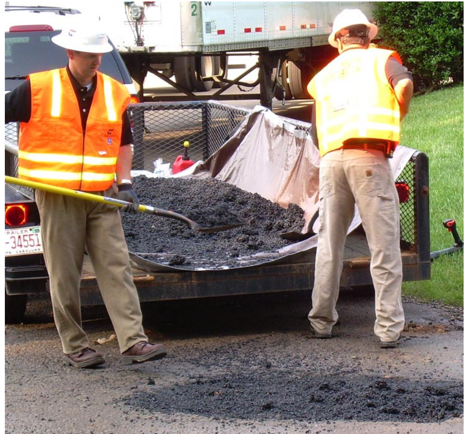
High-performance EZ Street® may be the next big thing to hit the market.

The material requires no mixing, and it's instantly ready for traffic. It's produced in a multi-step pro-